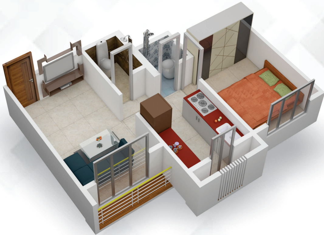
● 3D Floor Plan for 1BHK ●