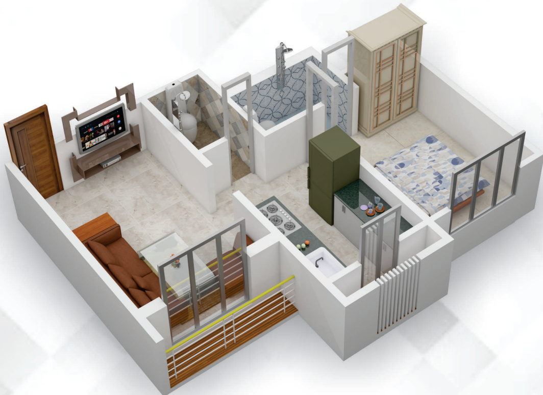
● 3D Floor Plan for 1BHK(master) ●