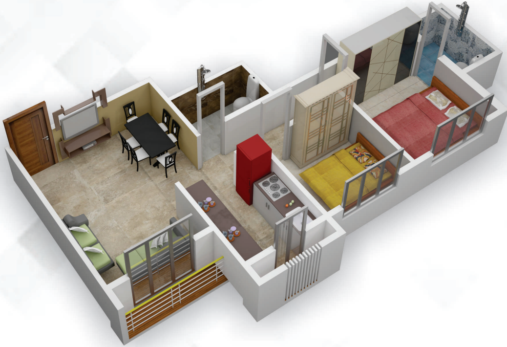
● 3D Floor Plan for 2BHK ●